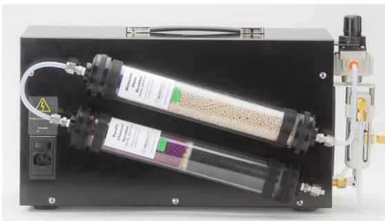
8301P Portable Zero Air Generator

The system comprises a compressed air source, permeation dryer and a series of optional scrubbers chosen depending on the application, producing clean, dry dilution quality 'zero air.'