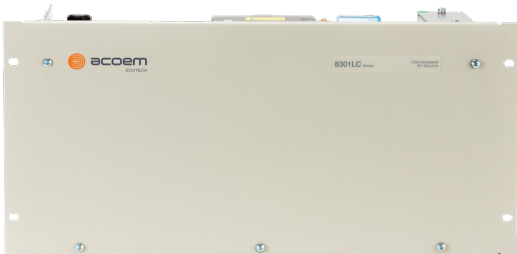
8301LC Zero Air Generator

The ACOEM Ecotech 8301 Series Zero Air Generators have been designed to supply zero air (contaminant free) to a dilution calibration system, such as the Serinus Cal 1000, 2000 and 3000.