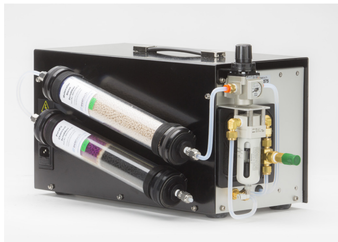
8301P Portable Zero Air Generator