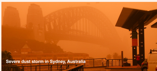
Severe dust storm in Sydney, Australia

Aurora™ integrating nephelometers are an ideal solution to help us in understanding, identifying and planning ways to control pollution and the imbalance in or degradation of the environment. This is why governments and Environmental Protection Authorities (EPA's) use our Aurora™ in visibility applications.